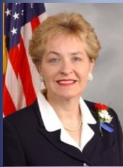
Rep. Marcy Kaptur 9 th Congressional District - Ohio